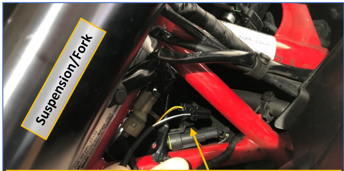
7) Rout long legs of blinker genie harness from behind steering neck area down to turn signal connectors on each side of motorcycle. Route wires inside of frame. See next image for more details.