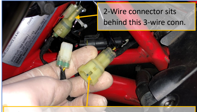
10 ) Locate the headlamp 2-wire connector attached to neck. Slide up and off of mounting tab on neck. Disconnect connector.

8) Connect Blinker Genie legs to mating connectors. Position connector from lamp into in retention slot.